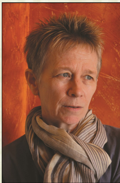
The community is also invited to attend the Fourth Annual Poetry

As part of its Fourth Sundays program, the Claremont Public Library will be hosting a public reading on Wednesday, October 7th at 5:30 p.m. The library is located in the Claremont Village on the corner of Harvard Avenue and 2nd Street, and parking is available on Harvard or in the parking lot behind the library on 2nd.